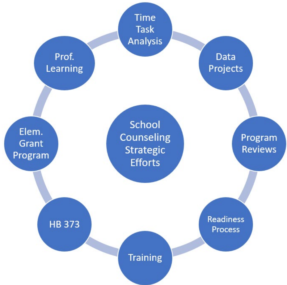
Figure 1. Categories of Strategic Efforts around School Counseling Services